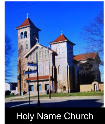
Holy Name Church

Early one morning I went to have a look around my old school. Holy Name wasn't like it was when I went there; attendance was falling off, the area rapidly gone downhill; people moving out. When I was a kid at Holy Name, every grade had two classes; but when my class