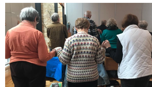
IVC Service Volunteers pray for our donors, our partners, each other, and those we serve.