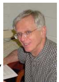
By Kevin Tansey

See Page 6 for some pictures of this event