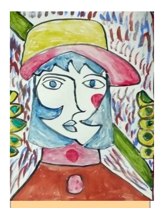
Art work by Craig Patak, a client of Pathway Homes Photo courtesy: InRoads, January 2013