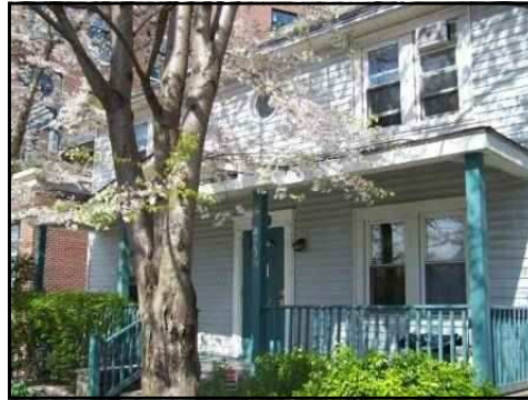
"Little Blue House" at Friendship Place

Carl is someone else I met. The first day I ever saw Carl, he was, of course, a stranger to me. I was grocery shopping when I saw him. He was taking steps at a snail's pace while looking stone-faced ahead, glancing