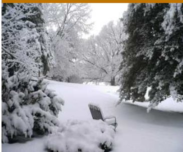
Dominican Retreat House In Winter Retreat House Photo

The January Day of Reflection will again be held this year at the Dominican Retreat House in McLean, Virginia. Dominican Retreat House is on a lovely tranquil hillside site on Old Dominion Drive near Dolley Madison Parkway (Rt. 123)