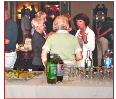
Tuesday Evening Social Gathering